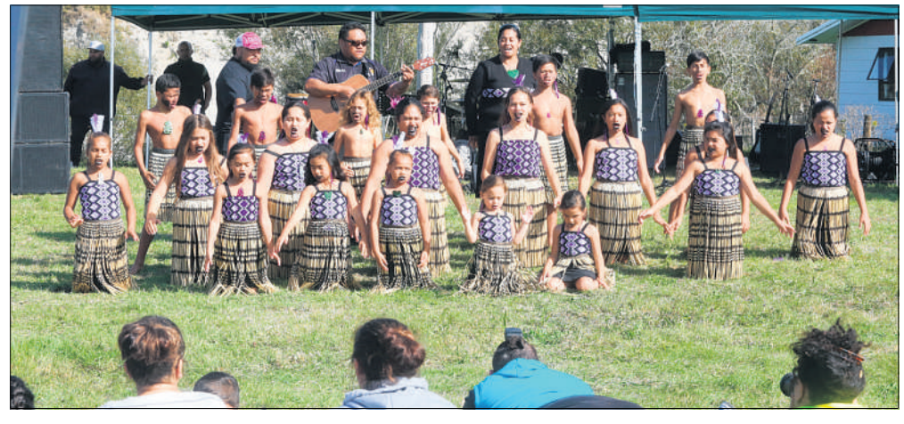
LITTLE WINNERS : Parakino's young kapa haka winners, Te Roopu o Parikino "midgies", performed for the crowd.